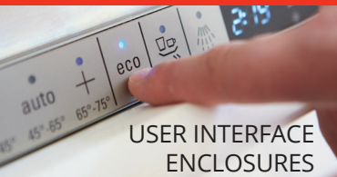
USER INTERFACE ENCLOSURES