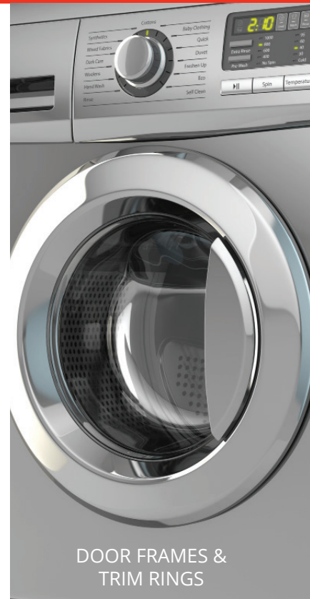
DOOR FRAMES & TRIM RINGS

Our GEON® vinyl formulations are ideal for a wide variety of large and small appliance applications. Work with us to discover how we can help expand your possibilities with the versatility of vinyl.