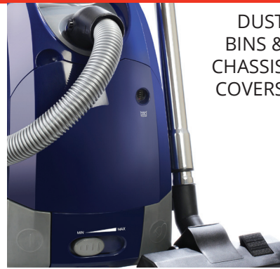
DUST BINS & CHASSIS COVERS