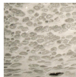
Inconsistent cell structure